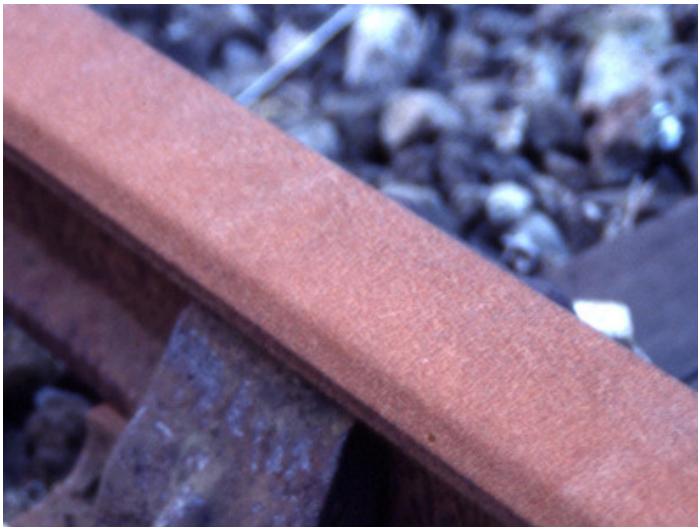
Wear seen on the outside of a curve.