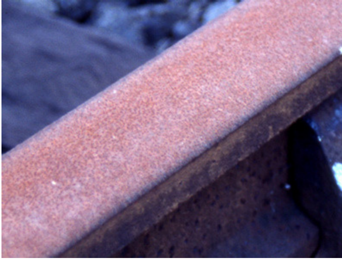
Wear seen on normal straight rail or the inside of curves. The top of the rail becomes mushroom shaped.

These rail profiles were photographed at Wymondham, Norfolk in 1990. The line to Dereham diverted at Wymondham round a very tight curve. The line had seen very little use for many years and the track was very worn. The wear seen is normal for the situation. I think the only trains were a few grain hoppers from Dereham in the harvest season and the weed killer train. Although the photographs are not the clearest, I hope you can clearly see the 'lip' that has formed. The rail was chaired bullhead and no super elevation. One can clearly tell that no trains had passed for some time. Wear on high speed, super elevated track can be different. This was a very slow speed curve throughout its history.